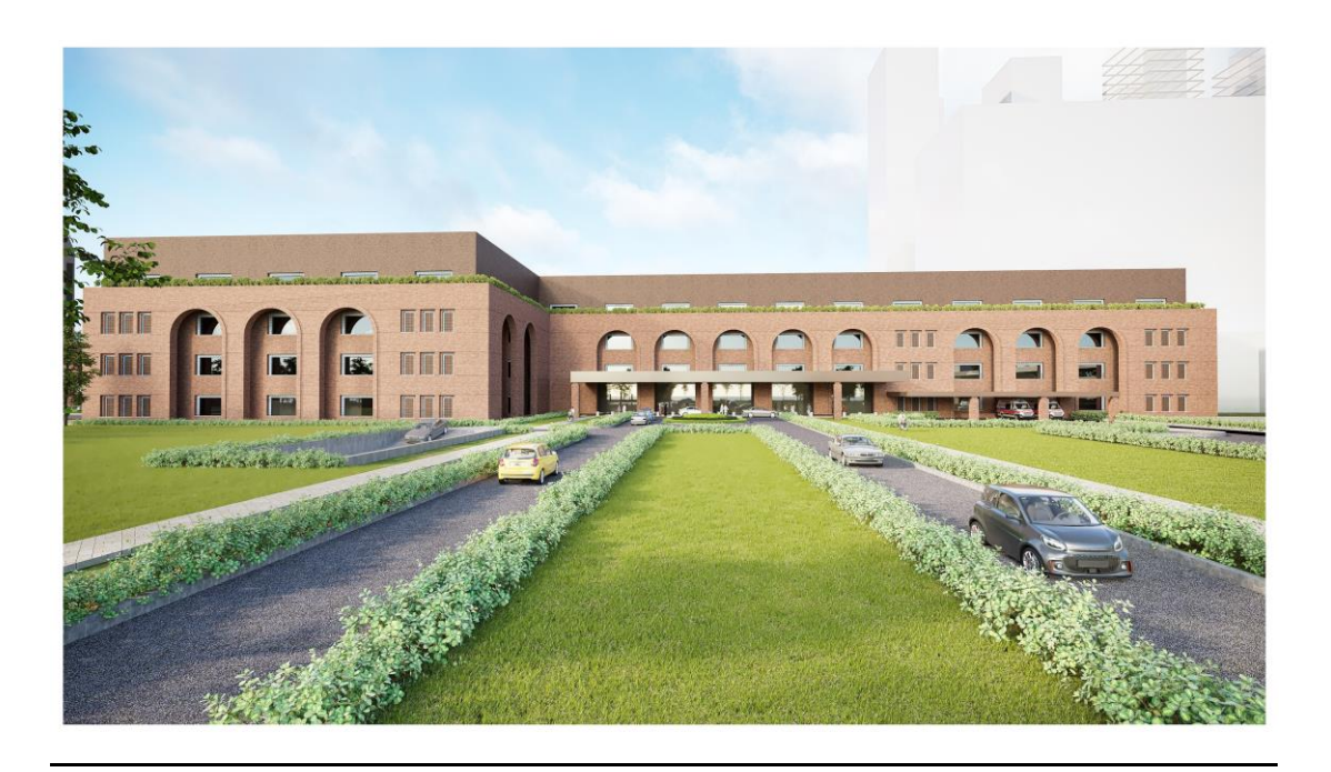
Main Hospital Building